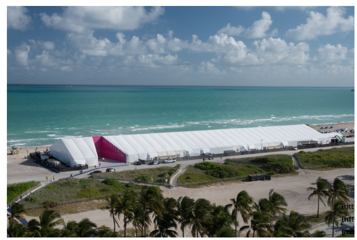
via Untitled Miami Beach

The fifth edition of Untitled Miami Beach (https://art-untitled.com/miami-beach) features 128 international galleries with 37 new exhibitors in an "expanded" space on the beach at Ocean Drive and 12th Street from November 30 to December 4. The VIP Preview is November 29, 3 to 8 p.m. They are also hosting several projects including a participatory installation by Rirkrit Tiravanija and Tomas Vu called "RT TV Boards" that features surfboards inscribed with Beatles lyrics, a T-shirt stand, surfboards that you can borrow and a shower to rinse off after you wipe out. This year's immersive-environment, Jungle Lounge, was designed by Brooklyn-based artist Daniel Gordon. Several non-profits including ICA Miami, Aperture Foundation, Microscope, ArtPod and Site:LAB will also be exhibiting at Untitled.