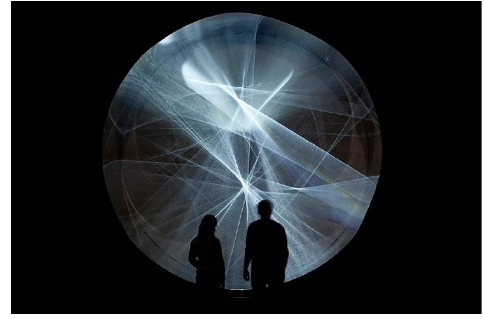
(htt (Inte (grea&a

The fifth edition of Untitled Miami Beach (https://art-untitled.com/miami-beach) features 128 international galleries with 37 new exhibitors in an "expanded" space on the beach at Ocean Drive and 12th Street from November 30 to December 4. The VIP Preview is November 29, 3 to 8 p.m. They are also hosting several projects including a participatory installation by Rirkrit Tiravanija and Tomas Vu called "RT TV Boards" that features surfboards inscribed with Beatles lyrics, a T-shirt stand, surfboards that you can borrow and a shower to rinse off after you wipe out. This year's immersive-environment, Jungle Lounge, was designed by Brooklyn-based artist Daniel Gordon. Several non-profits including ICA Miami, Aperture Foundation, Microscope, ArtPod and Site:LAB will also be exhibiting at Untitled.