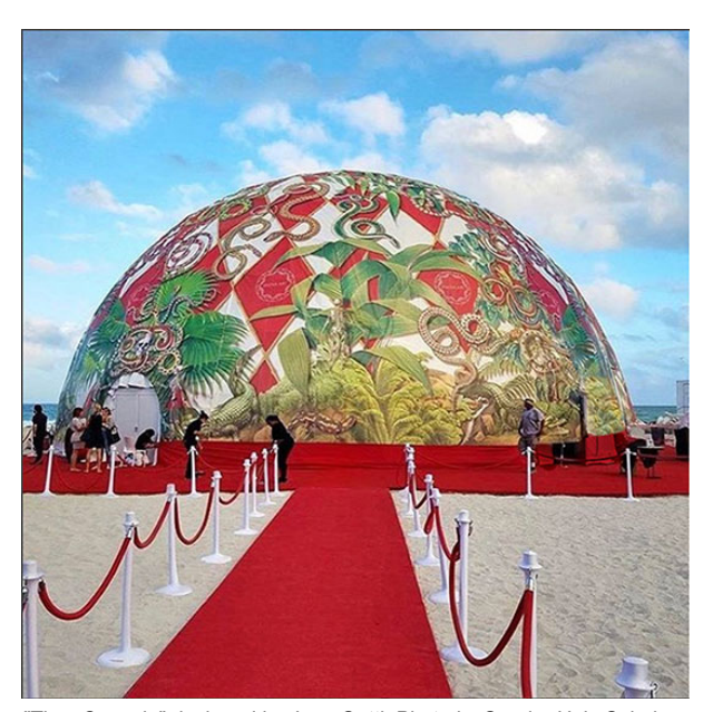
"Time Capsule" designed by Juan Gatti.

Just for fun for Miami Art Fair Week, an over-the-top Juan Gatti (http://www.designboom.com/art/juan-gatti-the-natural-sciences/)-designed party tent in the form of a geodesic dome was installed on the beach in front of the Faena Hotel Miami Beach (http://www.faena.com/miami-beach/). The temporary so-called Time Capsule played host to VIP parties for Mercedes sponsored events and featured a state-of-the art 360-degree film projections all the way around the ceiling inside.