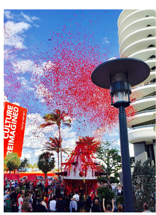
"Pelican Passage" float by Carlos Betancourt.

Another big hit of the parade—accompanied by music composed and performed live by the avantgarde musician <a href="Arto Lindsay">Arto Lindsay</a> (<a href="http://artolindsay.com/">http://artolindsay.com/</a>)—was the huge wedding cake shaped float called "Pelican Passage" by Miami artist <a href="Carlos Betancourt">Carlos Betancourt</a> (<a href="http://www.carlosbetancourt.com/">http://www.carlosbetancourt.com/</a>). Topped with a golden pelican and trailing red vinyl streamers and feathers, the float shot out confetti and lottery tickets to the oohs and ahhs of the crowd as it made its way up the street.