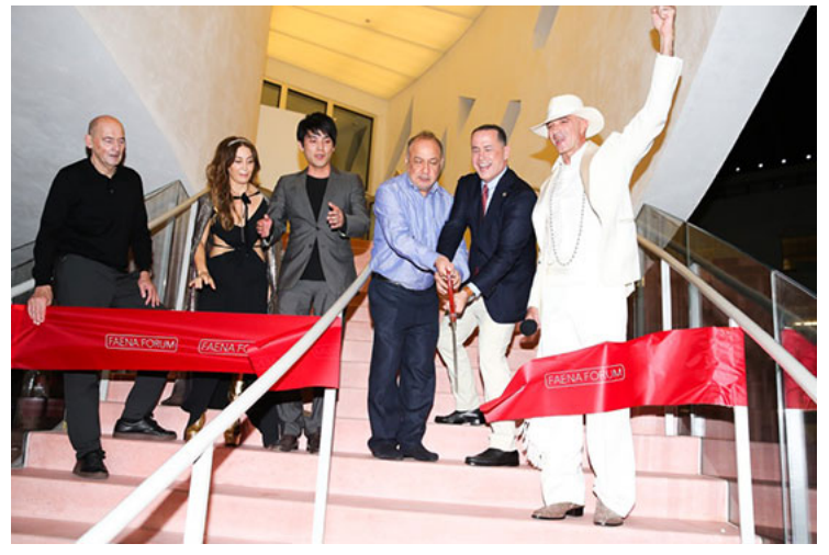
Faena Forum ribbon cutting with Rem Koolhaas and Alan Faena.

Just for fun for Miami Art Fair Week, an over-the-top Juan Gatti (http://www.designboom.com/art/juan-gatti-the-natural-sciences/)-designed party tent in the form of a geodesic dome was installed on the beach in front of the Faena Hotel Miami Beach (http://www.faena.com/miami-beach/). The temporary so-called Time Capsule played host to VIP parties for Mercedes sponsored events and featured a state-of-the art 360-degree film projections all the way around the ceiling inside.