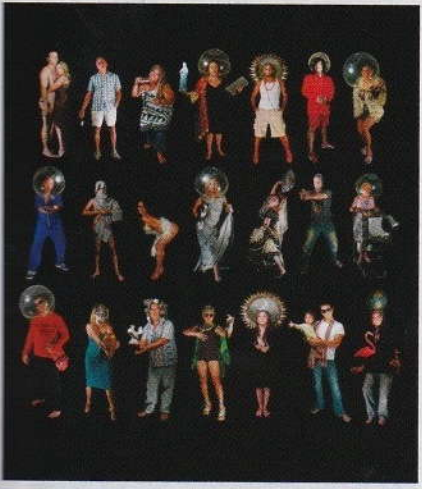
Detail of Carlos Betancourt's The Cut-Out Army, 2006, 100 individual cutouts on cardboard, each 8 feet tall.

he fifth edition of the international fair Art Basel Miami Beach (Dec. 7-10) once again offers visitors a cornucopia of citywide exhibitions and events geared to cutting-edge art. At the Miami Beach Convention Center, the principal venue, some of the world's most prominent galleries present their wares in the company of younger galleries comprising the Art Nova section of the fair. In a beachfront village of converted shipping containers situated a few blocks away, Art Positions offers the work of other