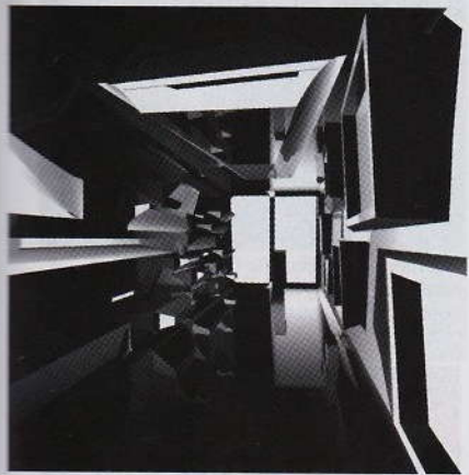
Zaha Hadid Architects: Digital rendering of a 42-foot container, 2006; at Kenny Schachter ROVE.

young galleries. One of the exhibitors, Kenny Schachter ROVE, London, has replaced the usual shipping container with a prototype portable pavilion designed by renowned architect Zaha Hadid that is itself for sale. A few of the other exhibitors have variously violated their containers or dispensed