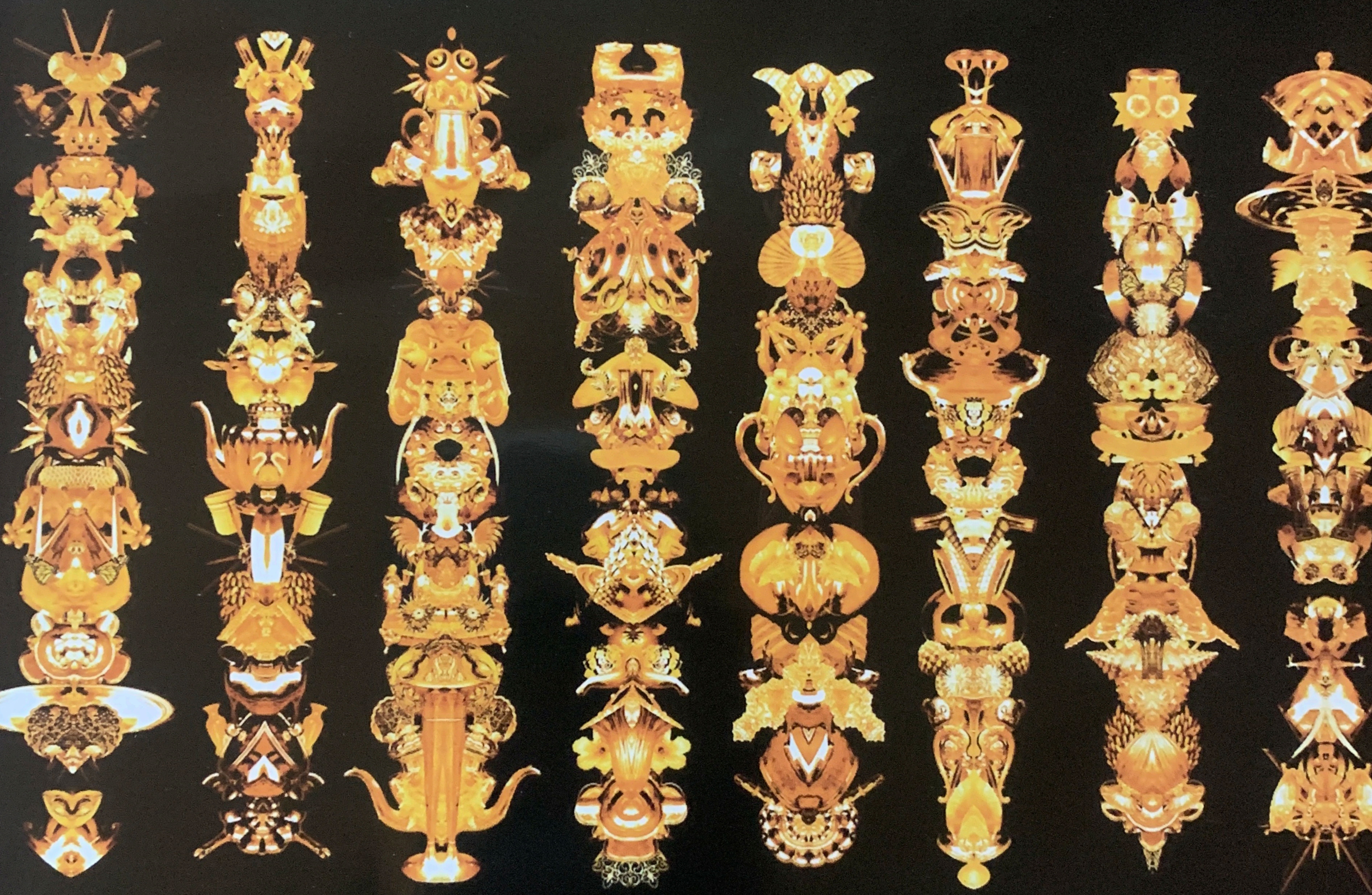
Carlos Betancourt- Walter Otero Contemporary Art Gallery Amulet For Light I (gold), 2012 Color photograph Editions: 72" x 109" and 12 1/2" x 19"