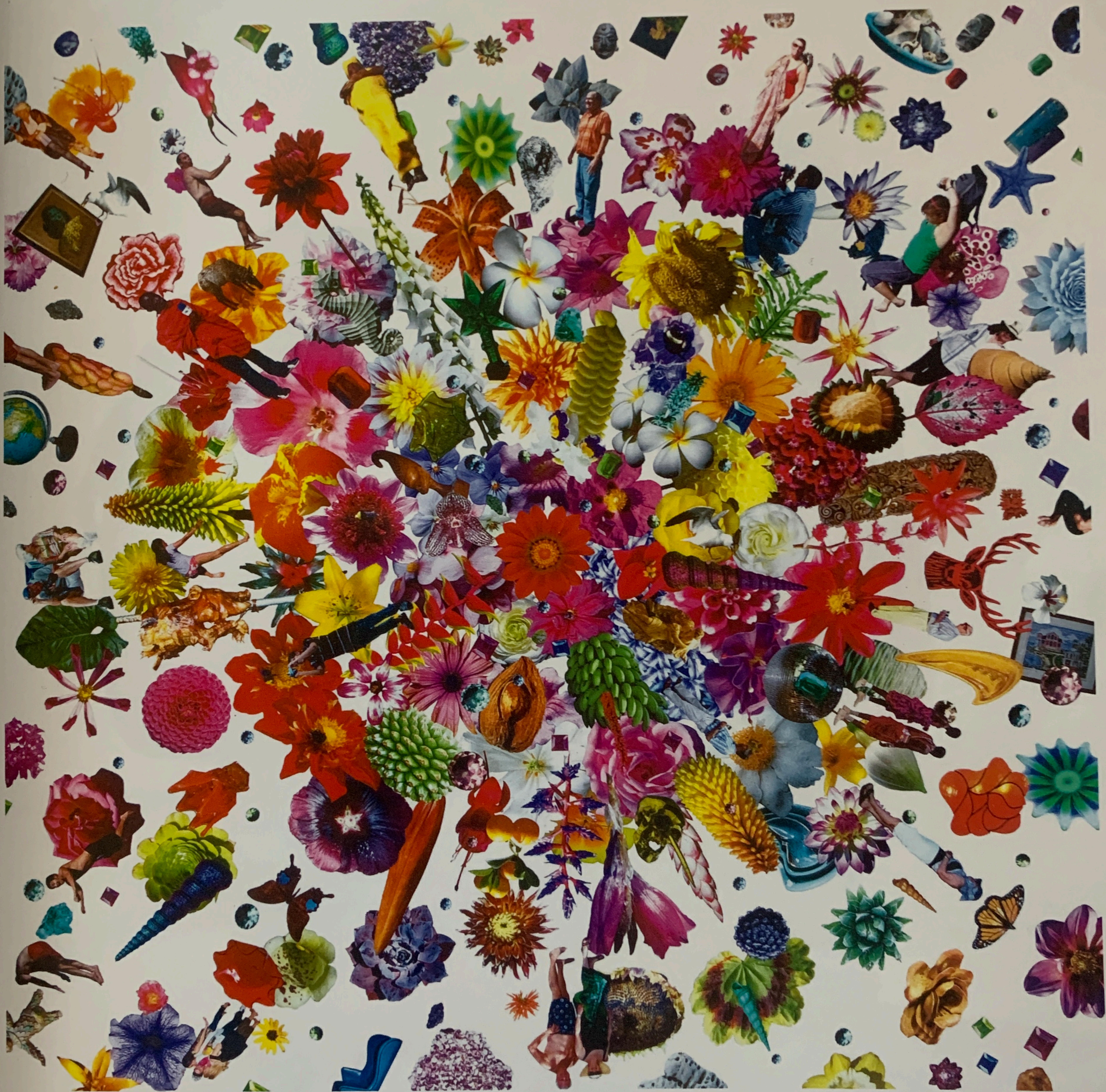
Carlos Betancourt- Walter Otero Contemporary Art Gallery Re- Collections, 2008 Print on Fine Paper, 16" x 16"